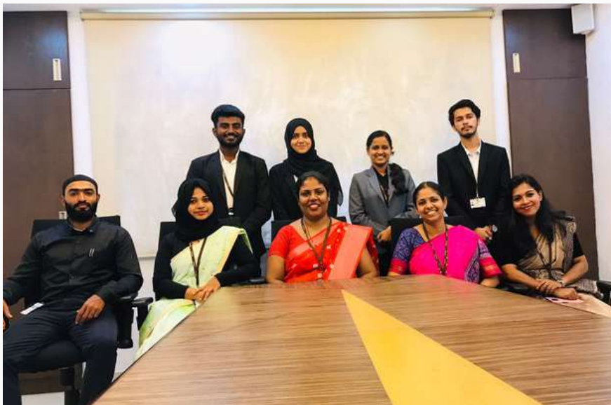
INTERVIEW PANEL OF BEST OUTGOING STUDENTS OF THE YEAR 2022